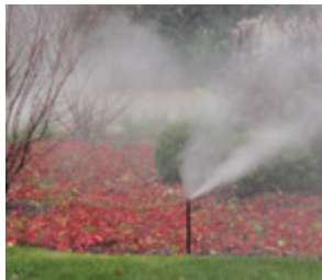
Blow out on a spray

WARNING! Wear ANSI-approved safety eye protection! Extreme care must always be taken when blowing out an irrigation system with compressed air. Compressed air can cause serious injury, including serious eye injury, from flying debris.