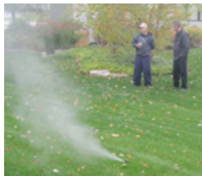
Blow out on a rotor

Flow sensors can potentially be damaged by winterization blow out techniques, and should be removed prior to injecting compressed air into the pipes.